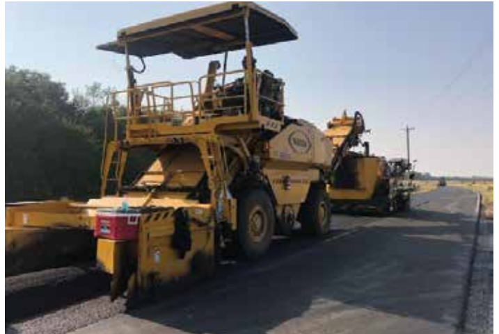
Dawson County Overton & Johnson Lake