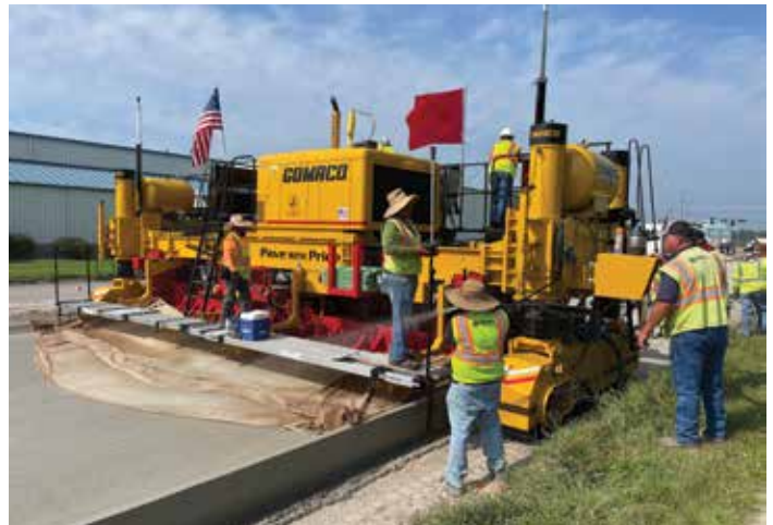
New Paver in Columbus